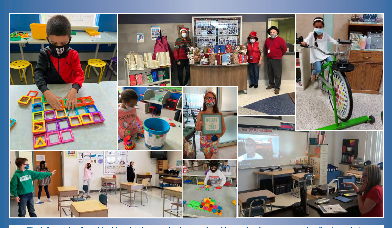
The information found in this calendar can also be translated into other languages on the district website at www.lackawannaschools.org.

Non-Profit U.S. Postage PAID Permit No. 366 Buffalo, NY