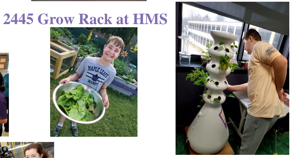
Hydroponic Grow Tower at HHS